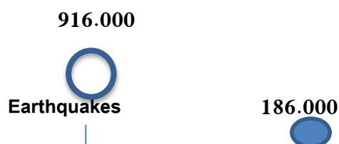
Fig.1. Graph showing displacement due to disasters during 2018

In 2018, the state of Kerala in southwestern India suffered the worst floods since the 1920s, displacing more than 1.4 million people from their homes and affecting more than 5.4 million people, while large parts of western Japan experienced devastating floods in late June and early July, killing at least 230 people and destroying thousands of homes. The floods also affected many parts of East Africa, including Kenya and Somalia, which were suffering from severe drought - Somalia knew 642,000 new internal displacement cases - as well as Ethiopia, North and Central Tanzania. 17